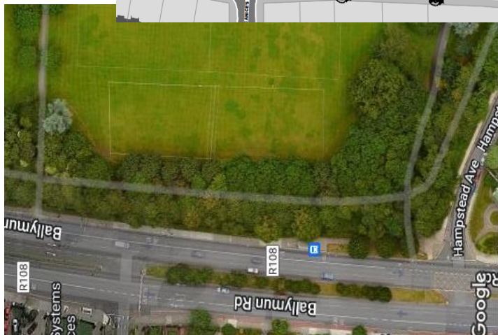
Existing park at location of proposed development

While recognising that some negative impact is unavoidable at this location, DCC will continue to work closely with TII to ensure that disruption is minimised and that park space and usage can be maximised for the local community during the construction period.